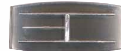
OVAL-SHAPED PAN BURNER