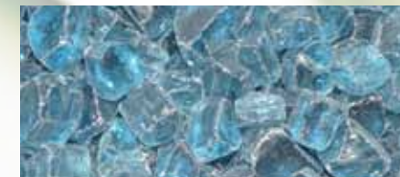
1/2" Pacific Blue