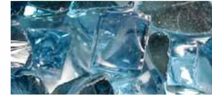
Pacific Blue Reflective